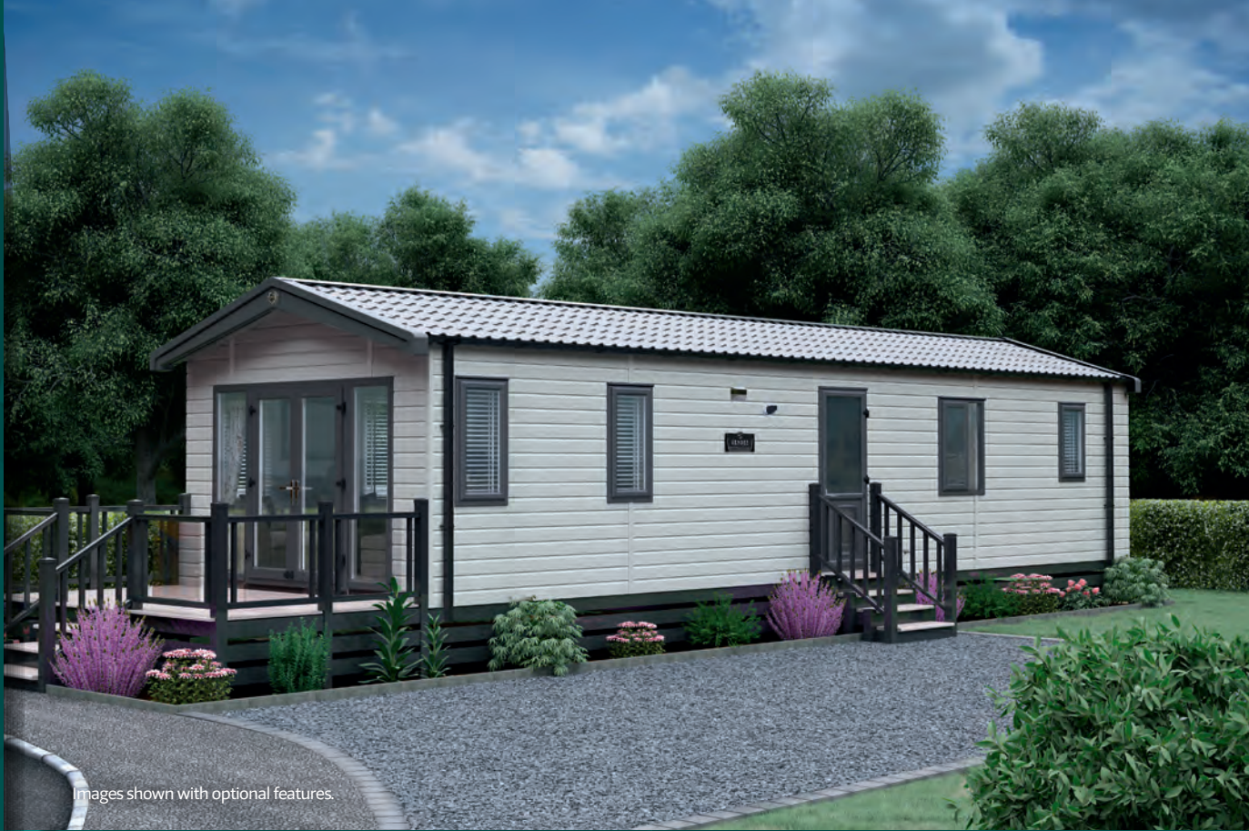
Images shown with optional features.