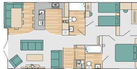
40' x 20' - 2 Bedroom