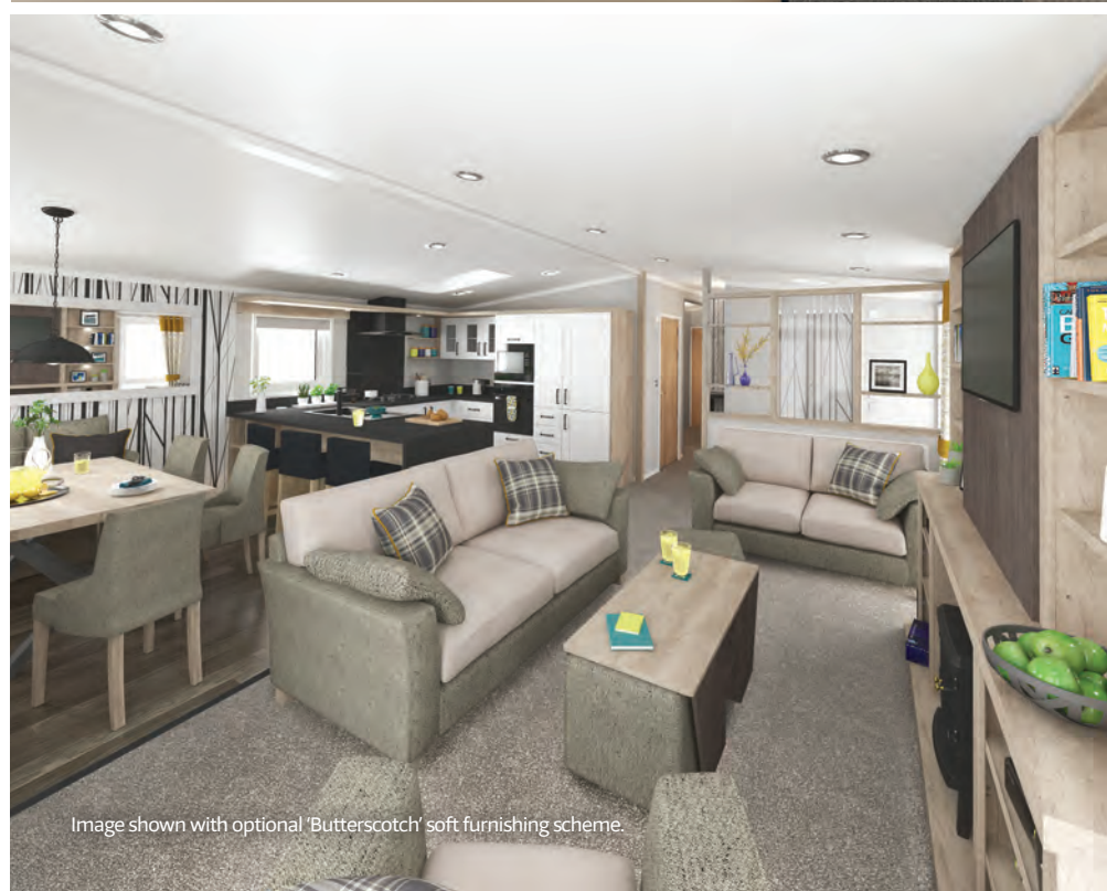
Image shown with optional 'Butterscotch' soft furnishing scheme.