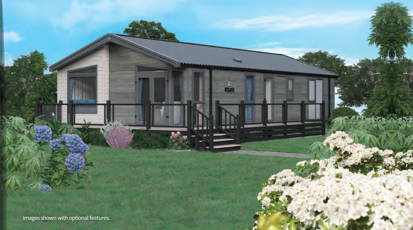
Images shown with optional features.